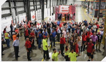
Employees and attendees join their elected leaders and Ozarks Coca-Cola management in a toast.