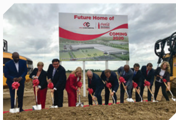
Public officials and corporate leaders wait for the groundbreaking of the new facility in North Houston.

As reported in our last issue, Coca-Cola Southwest Beverages