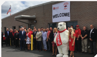
Smile ...and say Coca-Cola!

The Ozarks Coca-Cola / Dr Pepper Bottling Company celebrated the opening of its Northwest Arkansas Distribution Center on September 10th in Lowell, AR. The new facility brings nearly 150 new jobs to the area.